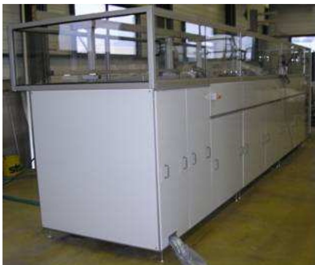
U5M60 machine with robot