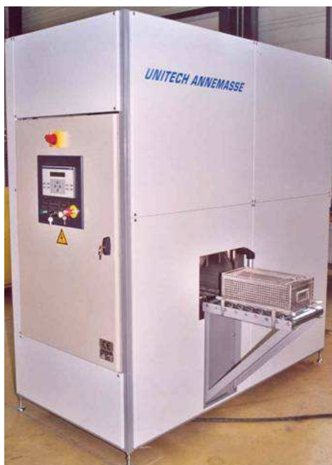
UDF 30 machine with manual loading